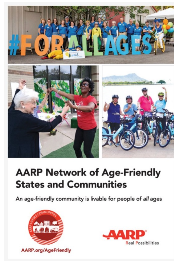
Pictured above: Cover of AARP Network of Age-Friendly States and Communities Introductory Booklet